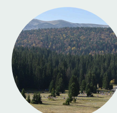
Dinaric Alps, Bosnia & Herzegovina