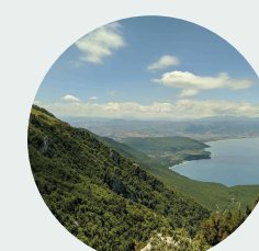
Galičica National Park, North Macedonia